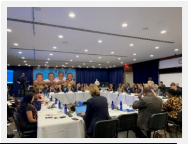
Dr Sania Nishtar Nutrition