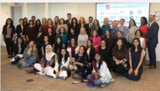
Special Assistant to the Prime Minister on Poverty Alleviation and Social Protection, Dr. Sania Nishtar in a group photo at the launch of US-Pakistan Women's Council Mentoring Campaign in New York, USA. (Dated: September 24, 2019)