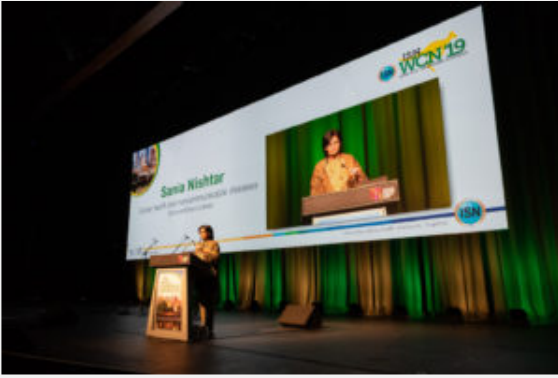
Chair of PACC gives Keynote Address in Melbourne