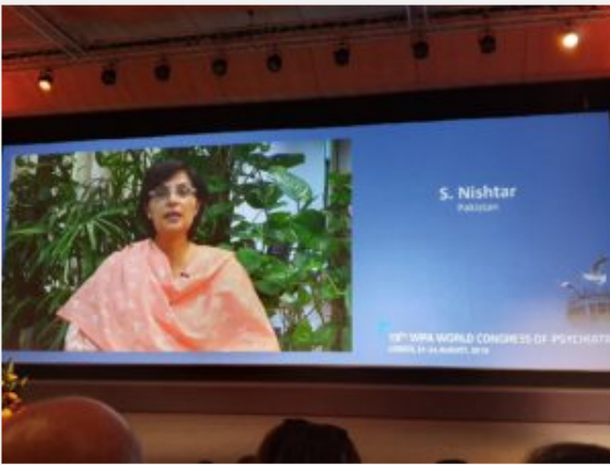
Dr. Sania Nishtar virtually addressing the World Congress of Psychiatry Lisbon