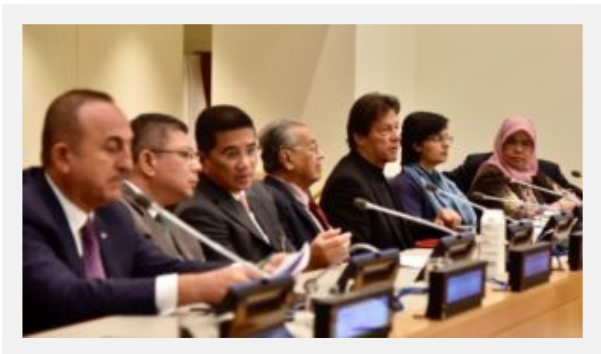
Dr Sania Nishtar NY