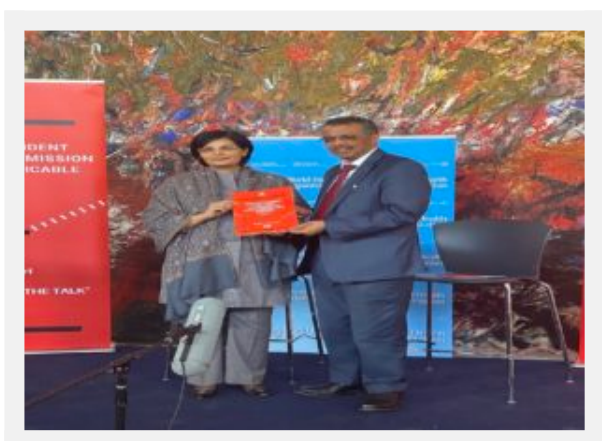
Dr. Sania Nishtar