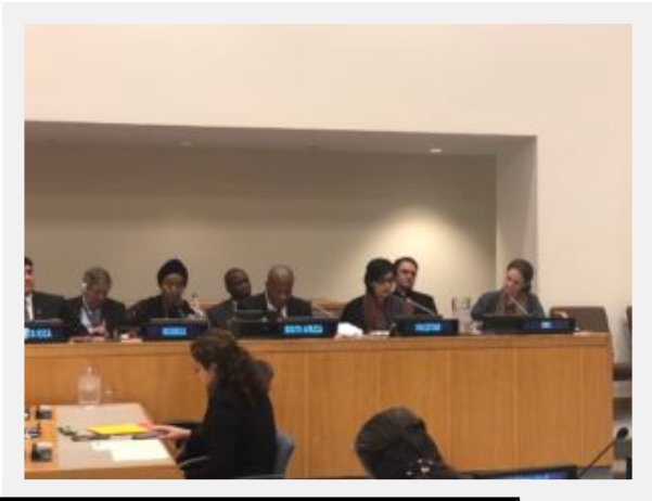
Dr Sania Nishtar UNGSA